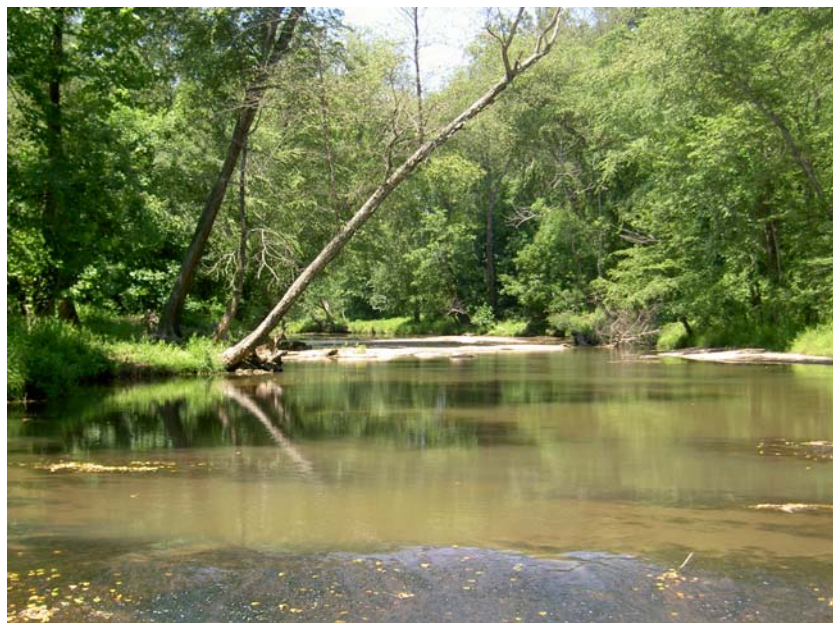
Left: Properties like this one on Cedar Creek in Franklin County could not be protected without generous support from our members and sponsors, or without willing landowners who have a desire to protect their land for generations to come. Their commitment to our future makes TRLC's work possible.